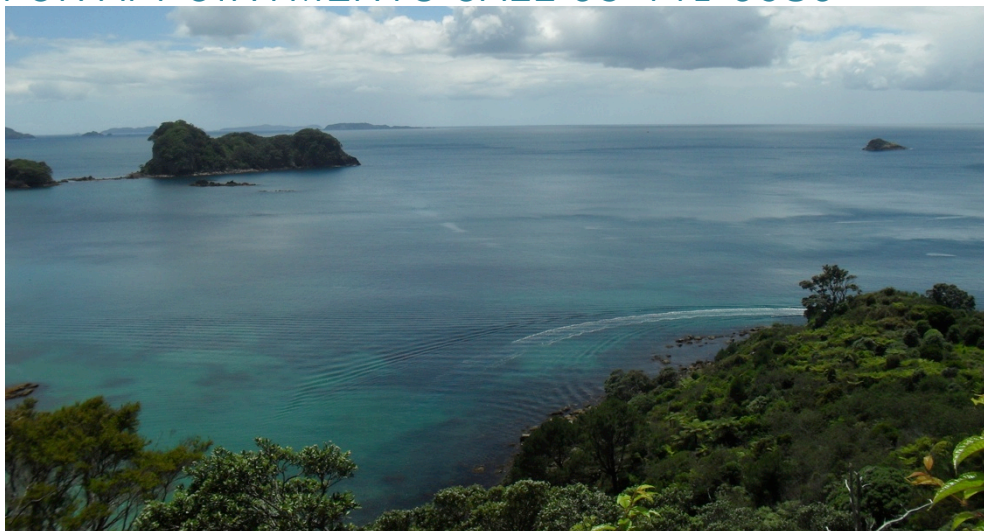
COROMANDEL PENINSULA – NEW ZEALAND